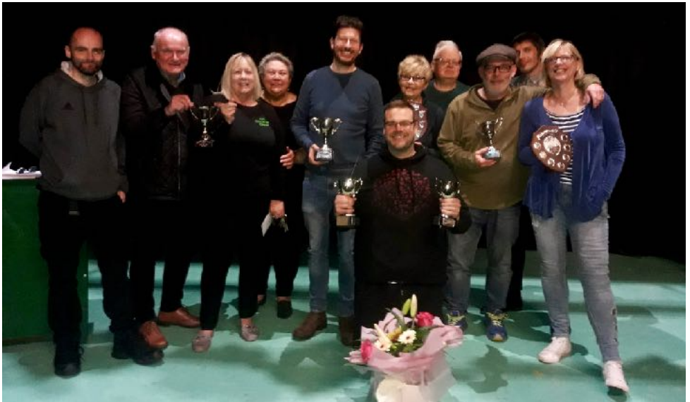
The winners of the Theatre Awards