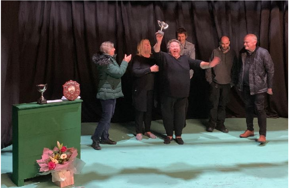
The Winning Cellar Bar Staff